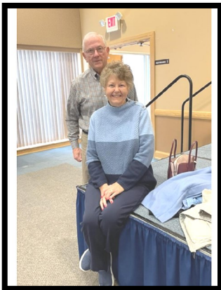
Lenten Lunch held at Grace Lutheran Church, March 20.

During this time of fellowship, kids participate in games or other fun activities to build relationships between their church peers.