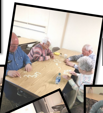
March 21 event. Lunch and Games