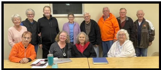
Some of the members present at Outreach's October 21 meeting.

Outreach members volunteered to ring the Salvation Army bell, in Buehler's vestibule, in one-hour shifts: December 5.